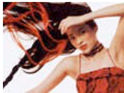
Zhang Ziyi on Time 100 list