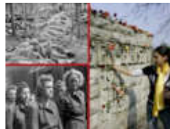
Nazi camp survivors mark 60th anniversary